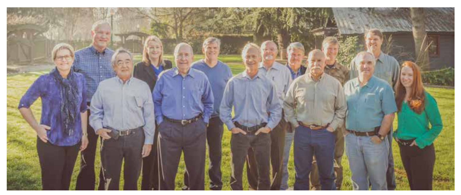
CFT BOARD OF DIRECTORS, TRUSTEE COUNCIL, AND STAFF