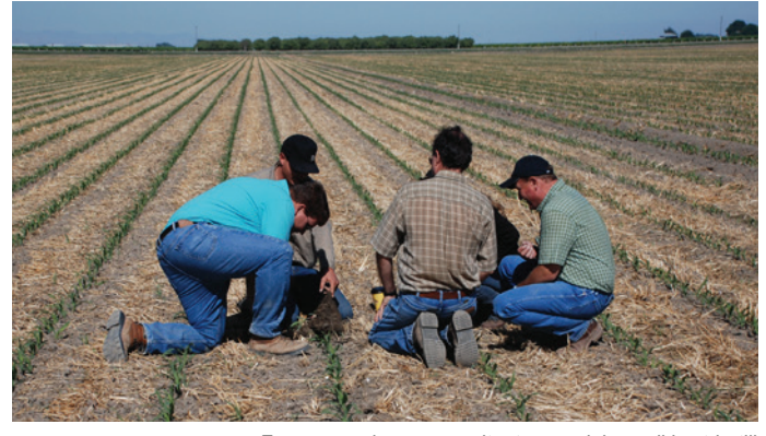
Farmers and crop consultants examining soil in strip-till conservation agriculture corn field. Merced, CA

One of the ways in which California farmers have been accessing information about conservation agriculture alternatives has been through the grassroots efforts of California's Conservation Agriculture Systems Innovation (CASI). Formed in 1998, CASI has grown to over 2,300 members – farmers, private sector, Natural Resources Conservation Service, university, and diverse agency representatives – who work together to develop and provide information related to conservation agriculture principles, practices and systems.