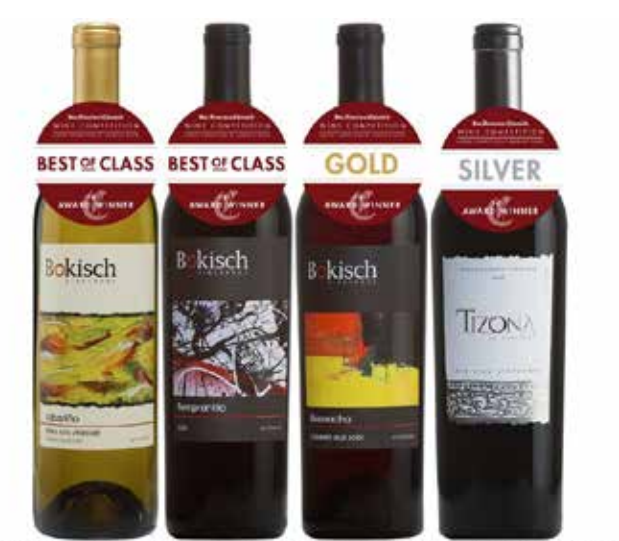
2017 San Francisco Chronicle Wine Competition

Visit www.bokischvineyards.com to learn more.