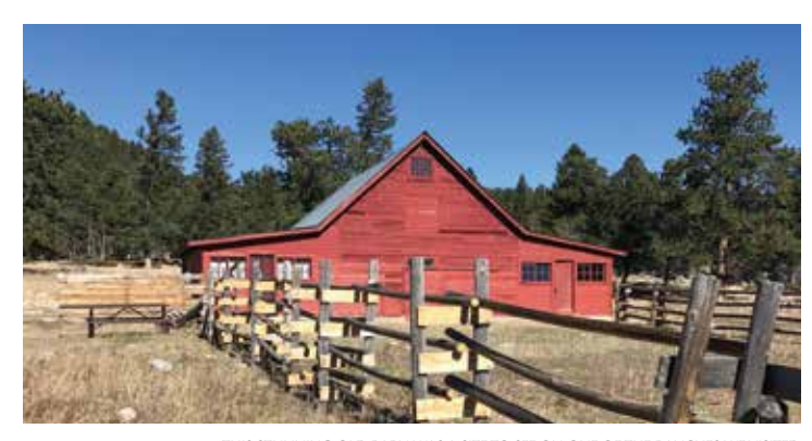
THIS STUNNING OLD BARN WAS A SITE TO SEE ON ONE OF THE RANCHES WE VISITED WHILE TOURING DENVER FARMS AND RANCHES DURING THE LTA RALLY