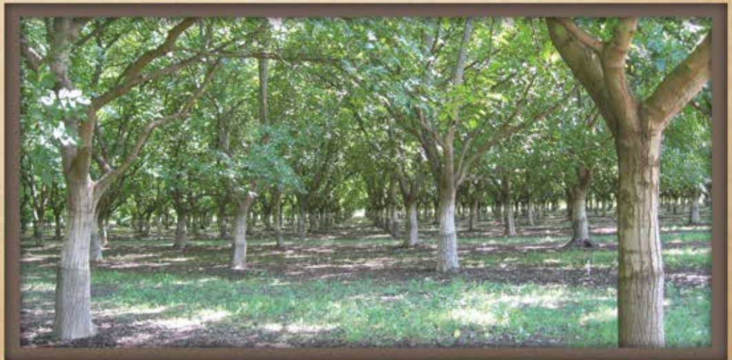
Brandstad Farm Walnut Orchard