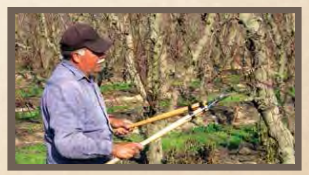
Pruning is necessary for successful peach production, pruning is done usually from December - February/March