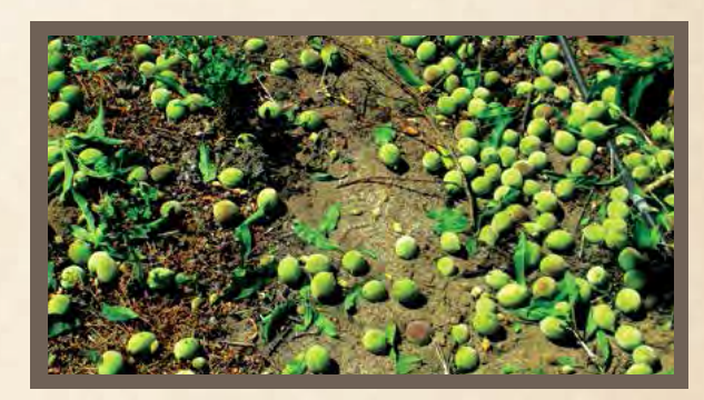
Thinned fruit left on ground to add organic material back in to soil

Fresh market peaches are always freestone. Processing peaches are mostly clingstone and sometimes freestone. Processing peaches can be canned, frozen or used for some other processed use. For example, the Dole processing plant in Atwater makes instant quick-freeze sliced peaches that are prized for making pies and other products. When your mother canned peaches at home, she probably used cling peaches because the firm flesh does not get mushy during cooking. 1