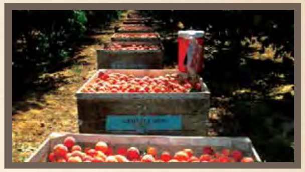
Full fruit bins in tree row will be loaded onto trucks and taken down the road to Dole for processing within hours