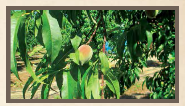
Fruit left after thinning