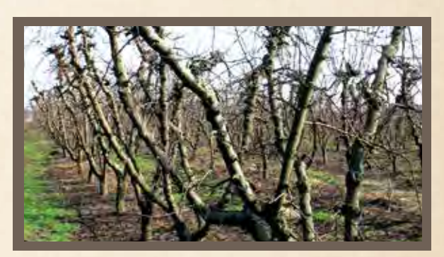
Peach trees are dormant, now is the time for pruning